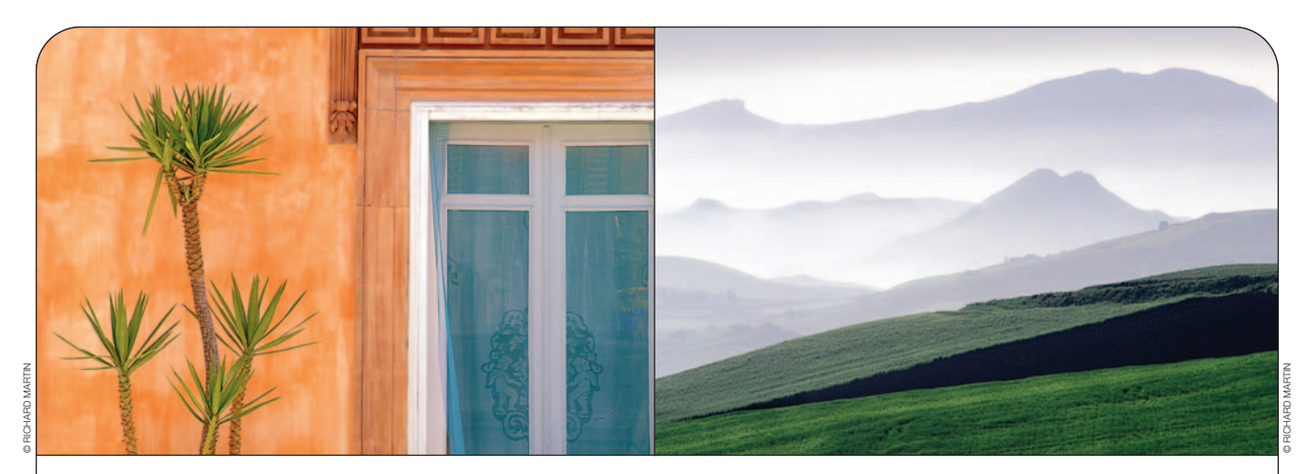
Make an effort to relate the photos that you make with your own experience and impressions instead of merely repeating what you see on postcards and travel brochures.